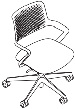
Plastic Back Upholstered Seat